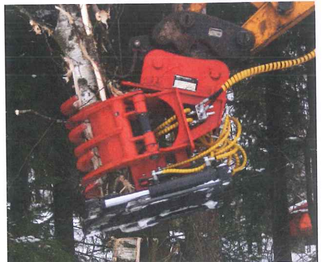
Naarva EV38 without collecting grippers